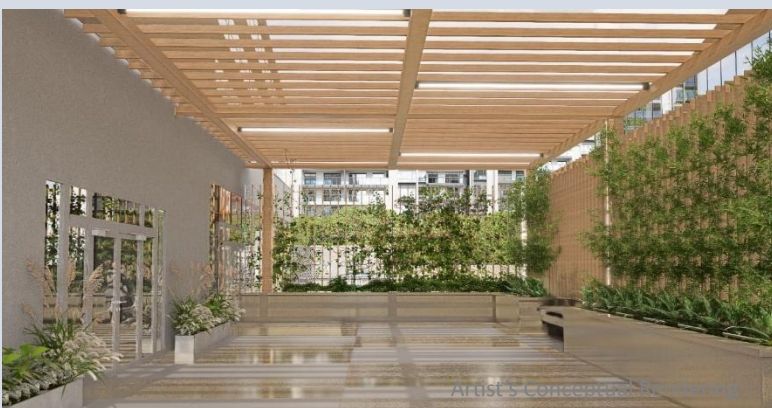
Entrance Plaza to East and West Blocks