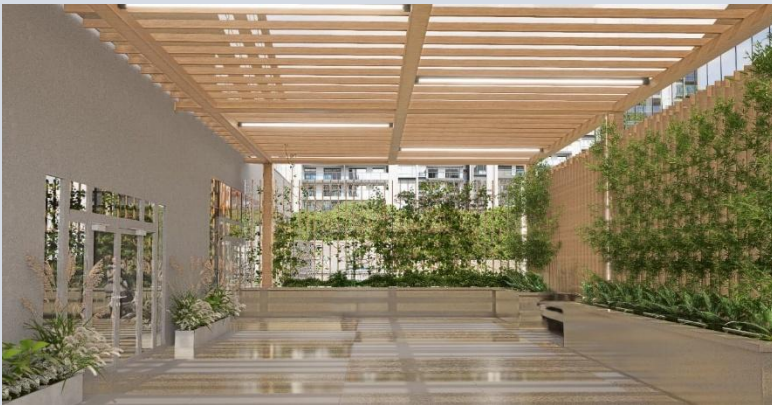
Plaza - Entrance to West Block